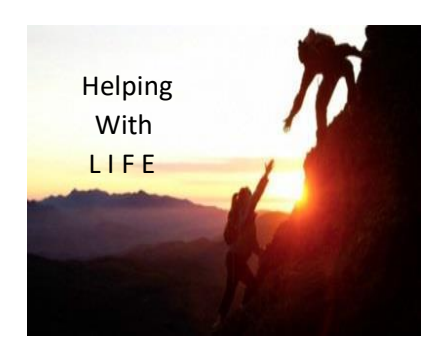
Pine Run Church of Christ

Remember to pray for School Administration