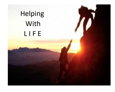
Pine Run Church of Christ

Remember to pray for School Administration & Carter Middle School