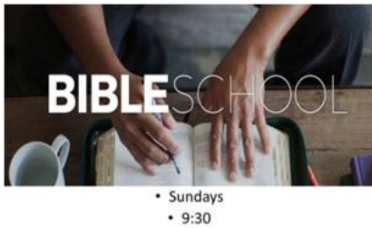
Figure 1 "Fulfilled Prophecies in Matthew"

The Heavenly Father savors the times His children spend talking with Him. Praise Him for who He is; give thanks for what He's done; unload your burdens; seek guidance; lift up others in prayer! You can talk to Him any time, any place about any thing!