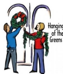
"The Point" Newsletter

This is your chance to encourage others by helping out. Let us know of your interest and we will help you from there!