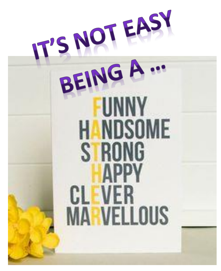
Pine Run Church of Christ 11549 N. Saginaw Road Clio, MI 48420 pinerunchurch.org