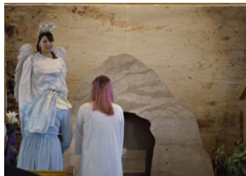
Angel appears to women