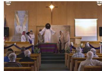
Jesus is coming Back!