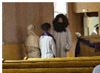
Jesus appears to 2 on Road to Emmaus