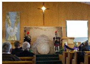
Soldiers Guard Tomb