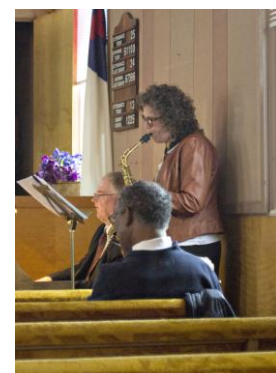
And finishing the day looking back on the victories we've been blessed with!