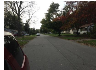
3 One of the Neighborhoods