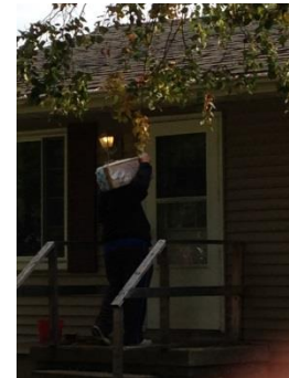
4 Another Delivery