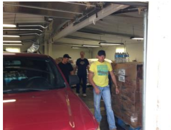
2 Packing Vehicles