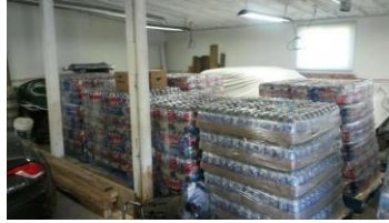
1 Water in Storage

Instruction based on God's Word can help show residents