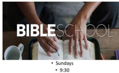
Figure 1 "Women of the Bible" Study

Pray for others and you will discover that God will draw you closer to them in countless ways.