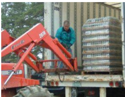
Operation “We Care”