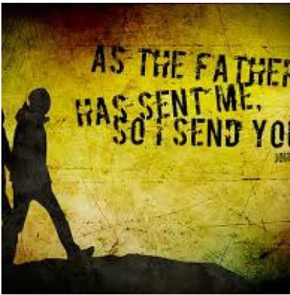
Lowell “Buddy” Mason Ministries